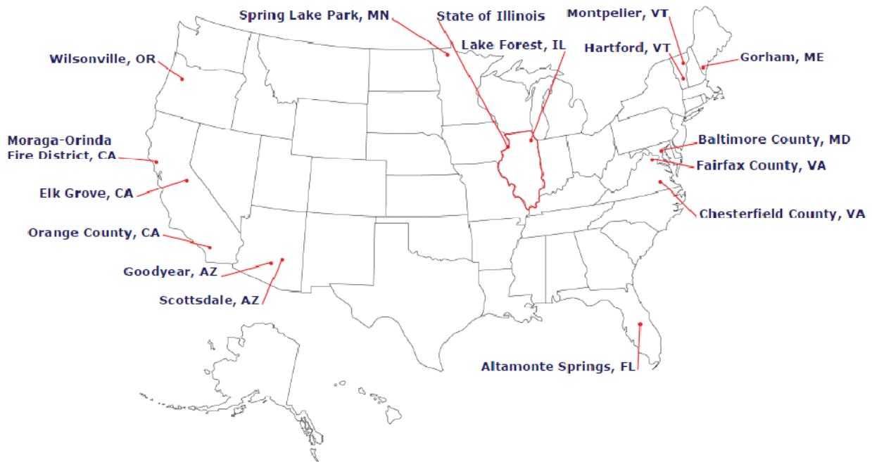
Figure 1: Locations of jurisdictions with fire sprinkler incentives which were included in the study.

Table 1 below summarizes each of these communities and which types of incentives were identified in a jurisdiction. Following this table, a summary of each jurisdiction characterizes the type of incentive, its structure, and its background in the jurisdiction.